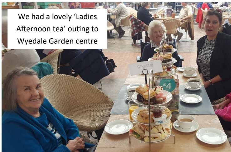
We had a lovely 'Ladies Afternoon tea' outing to Wyedale Garden centre