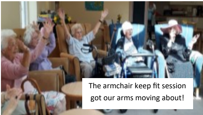
The armchair keep fit session got our arms moving about!