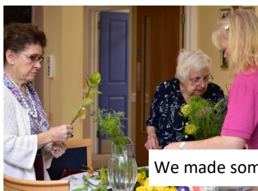
We made some lovely flower displays