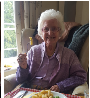
Fish & Chips from the 'Chippie' was a special request— Delicious!!