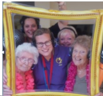
The silent disco in full swing