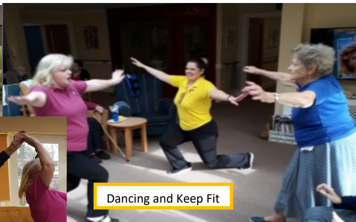
Dancing and Keep Fit