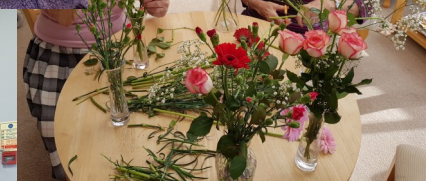
Taking part in armchair exercises