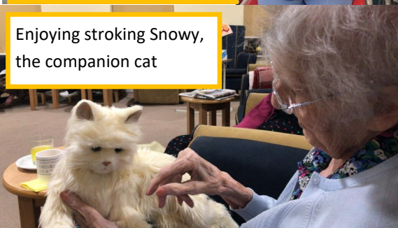
Enjoying stroking Snowy, the companion cat