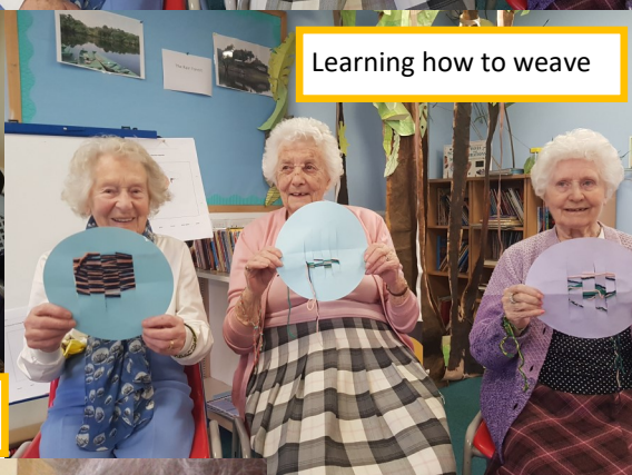
Learning how to weave