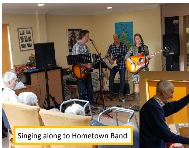
Singing along to Hometown Band