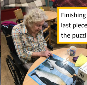
Finishing the last piece of the puzzle