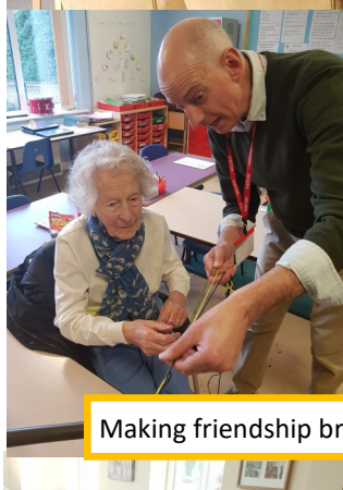
Making friendship bracelets at school