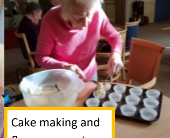
Cake making and flower arranging