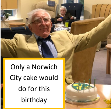
Only a Norwich City cake would do for this birthday