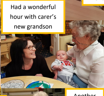
Had a wonderful hour with carer's new grandson