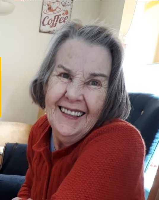
Just having such a lovely smile!

Please visit our website to see all the activities that we have coming up for the following month : www.margarethouse.co.uk/News & Event's