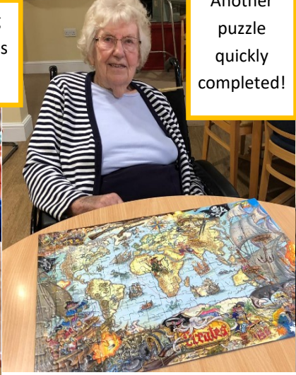
Another puzzle quickly completed!