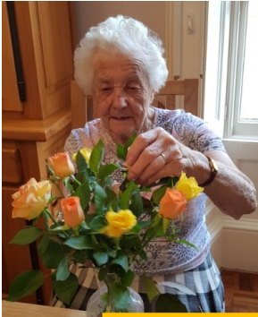
Made some lovely spring flower arrangements