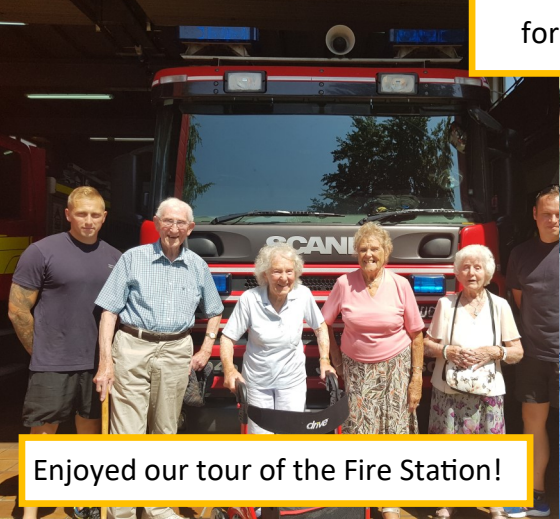
Enjoyed our tour of the Fire Station!