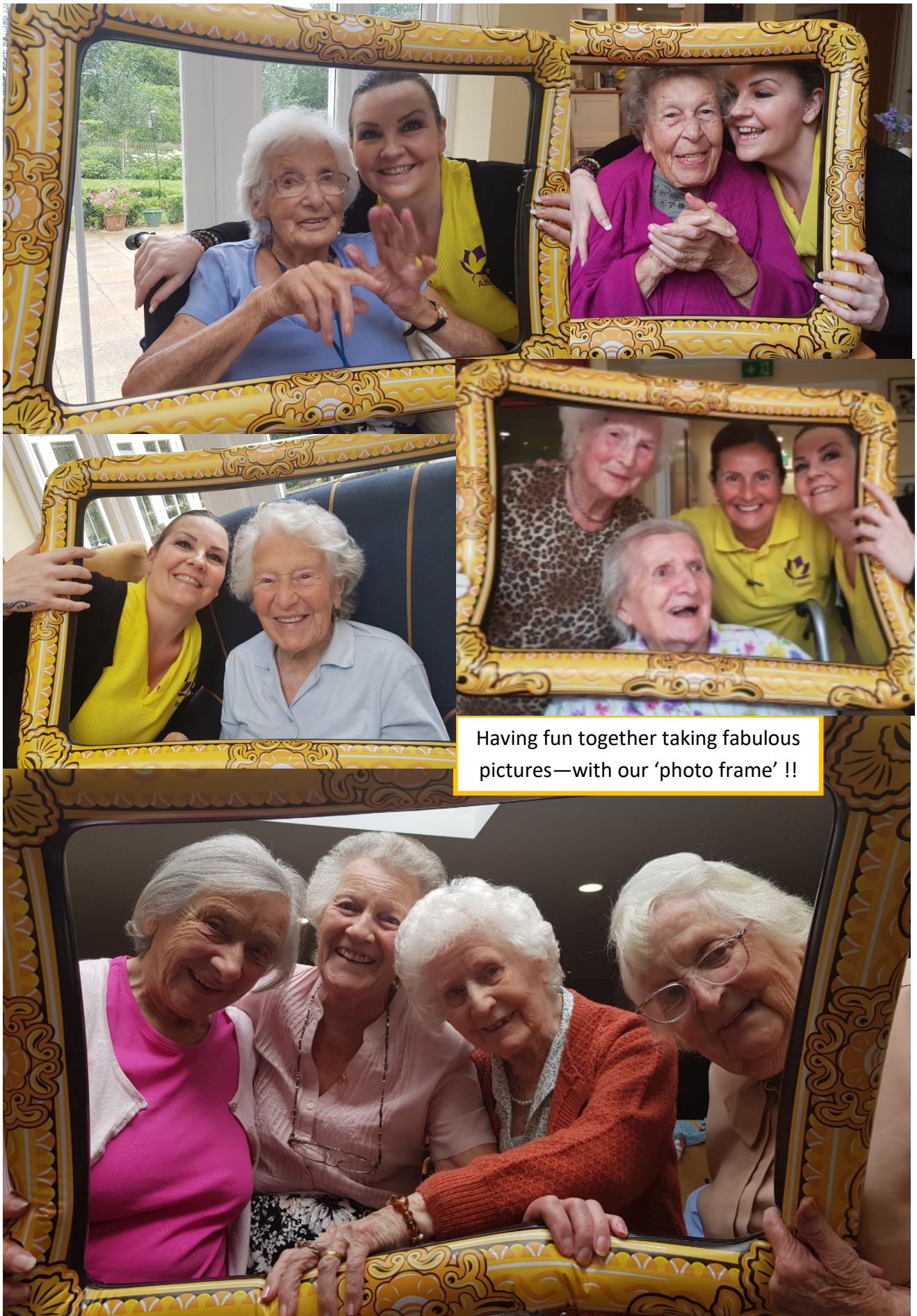
Having fun together taking fabulous pictures—with our 'photo frame' !!