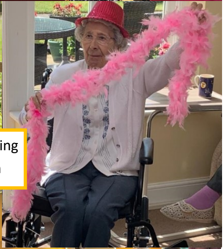
Had a great open Magic Morning for HCPA Good Care Month