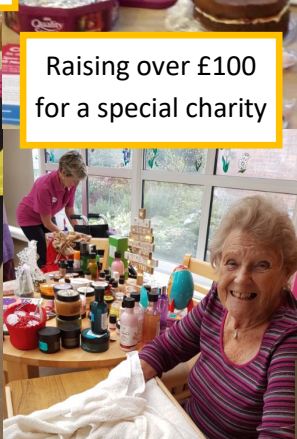
Being pampered at the Body Shop stall!