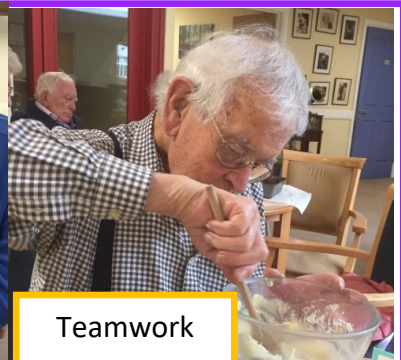
Teamwork making cakes & decorating