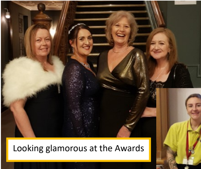
Looking glamorous at the Awards