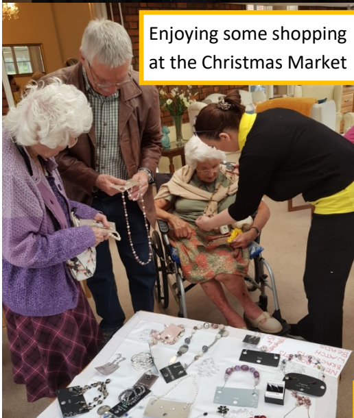
Enjoying some shopping at the Christmas Market