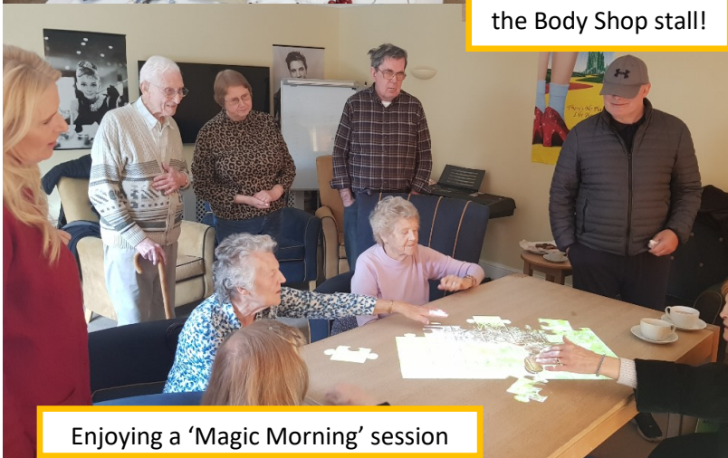
Enjoying a 'Magic Morning' session