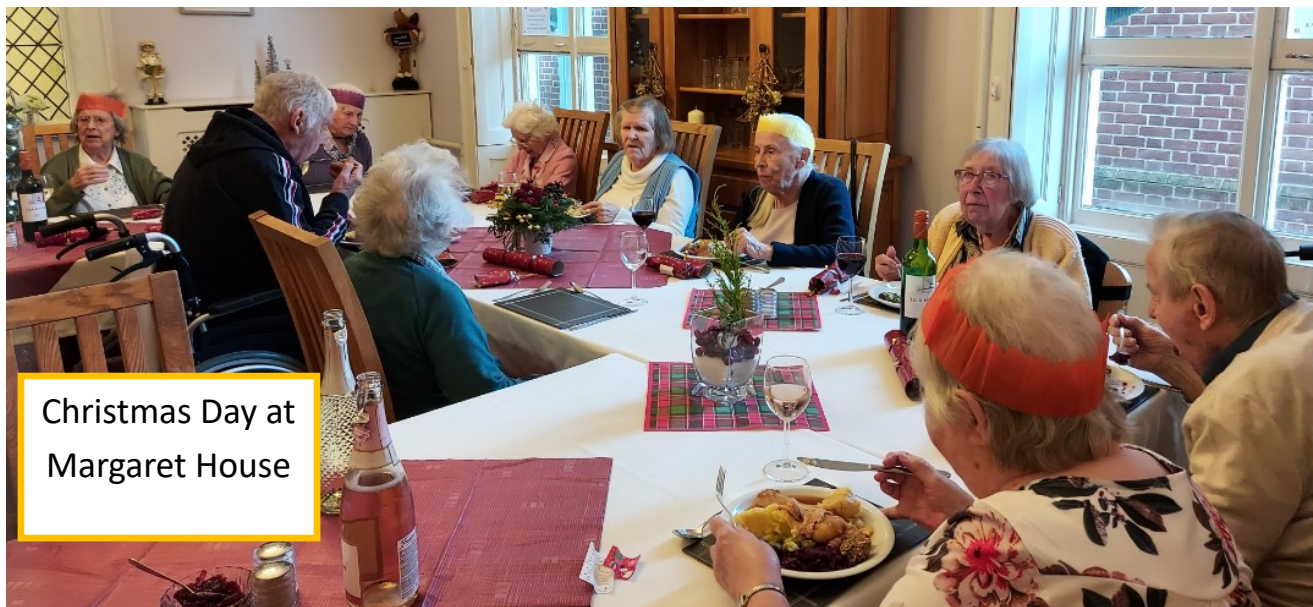
Christmas Day at Margaret House