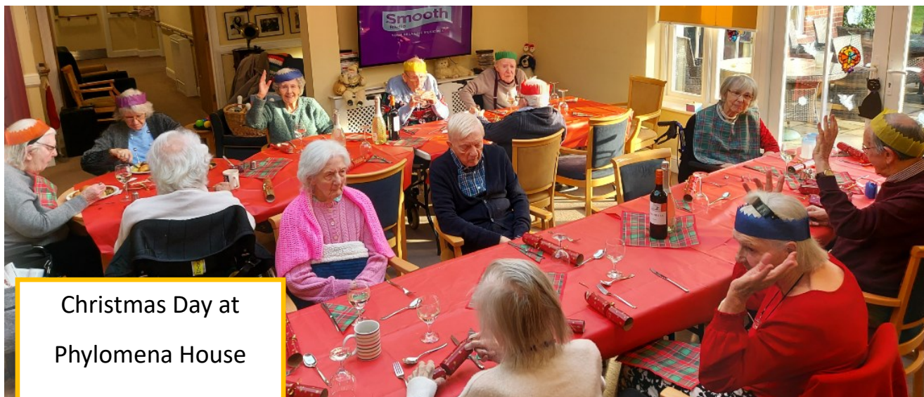
Christmas Day at Phylomena House