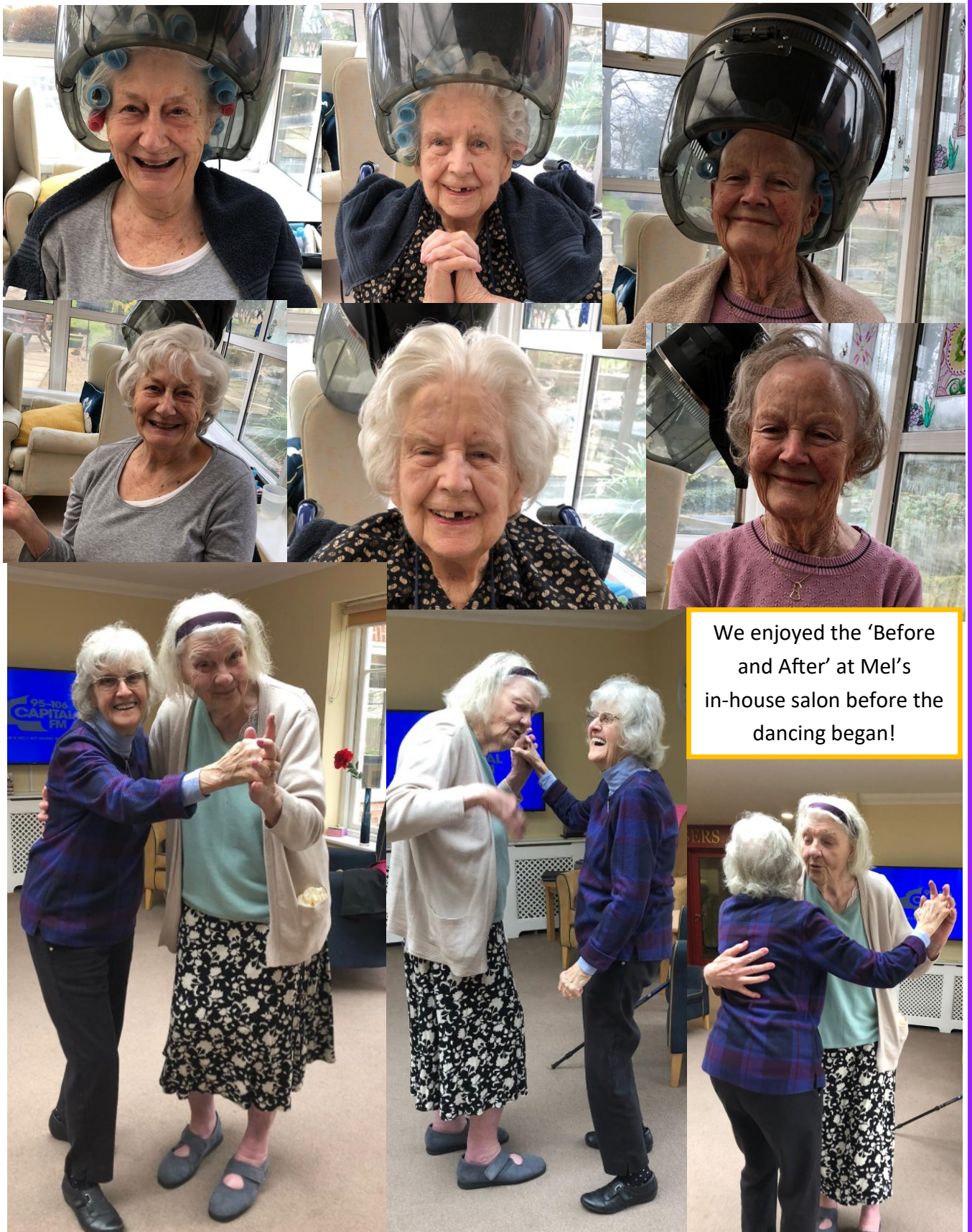
We enjoyed the 'Before and After' at Mel's in-house salon before the dancing began!

Please visit our website to see all the activities that we have coming up for the following month : www.margarethouse.co.uk/News & Event's