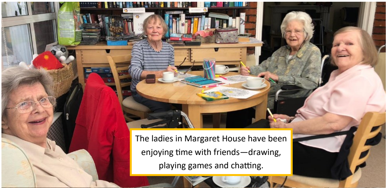
The ladies in Margaret House have been enjoying time with friends—drawing, playing games and chatting.