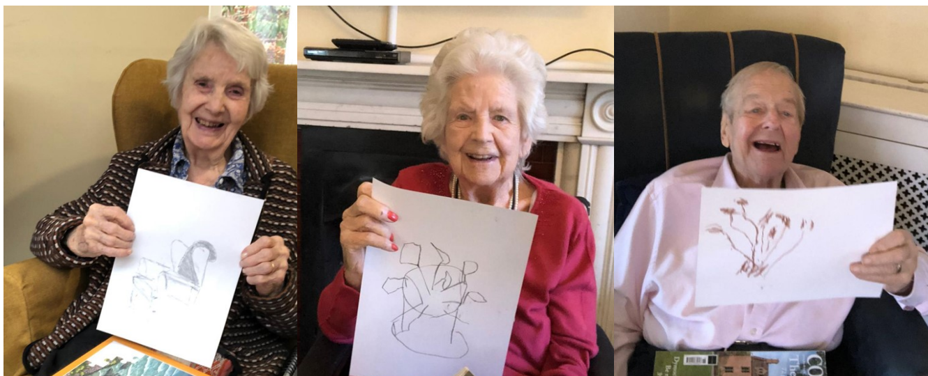
We enjoyed drawing as well as garden walks