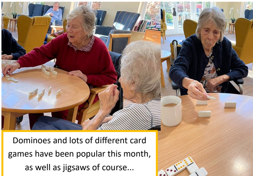
Dominoes and lots of different card games have been popular this month, as well as jigsaws of course...