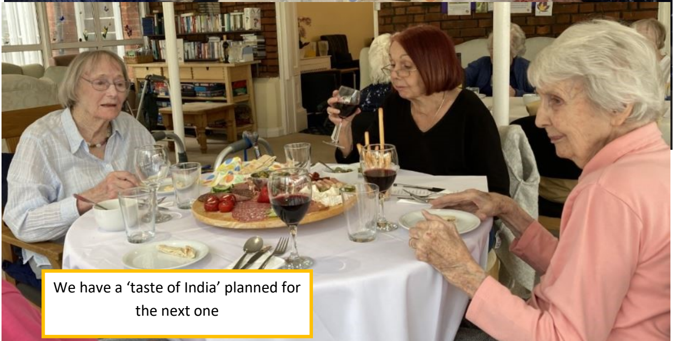
We have a 'taste of India' planned for the next one

Please visit our website to see all the activities that we have coming up for the following month : www.margarethouse.co.uk/News & Event's Follow us on Facebook : Margarethouse residential & dementia care home Follow us on twitter : @MargarethseH