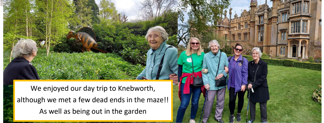
We enjoyed our day trip to Knebworth, although we met a few dead ends in the maze!! As well as being out in the garden