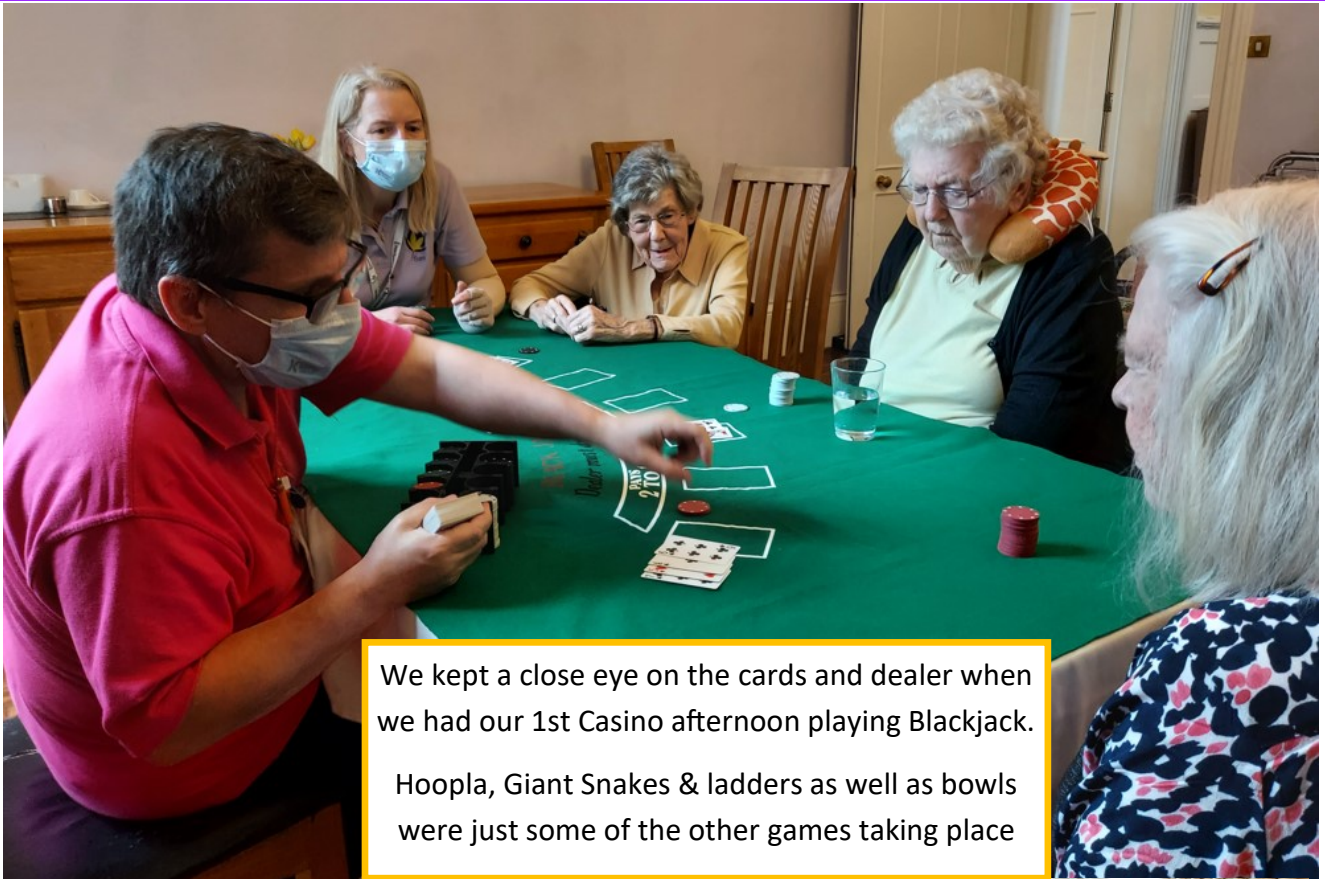
We kept a close eye on the cards and dealer when we had our 1st Casino afternoon playing Blackjack. Hoopla, Giant Snakes & ladders as well as bowls were just some of the other games taking place