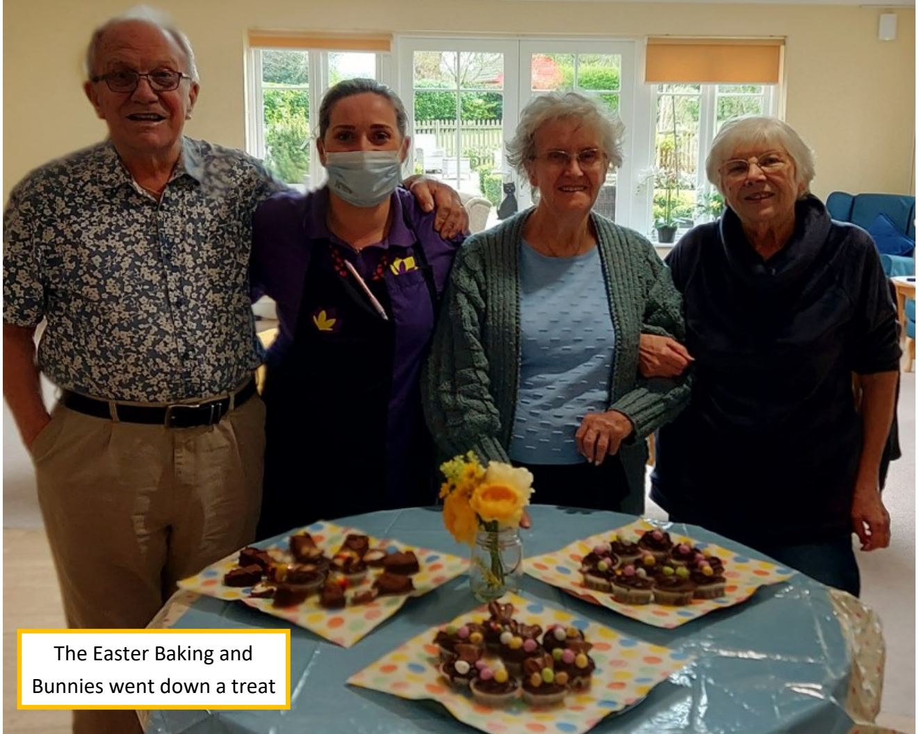
The Easter Baking and Bunnies went down a treat

Please visit our website to see all the activities that we have coming up for the following month : www.margarethouse.co.uk/News & Event's Follow us on Facebook : Margarethouse residential & dementia care home Follow us on twitter : @MargarethseH