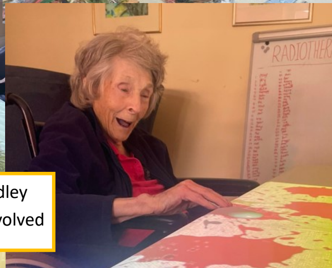
The Magic Table and Kiddley Divey sessions got us all involved