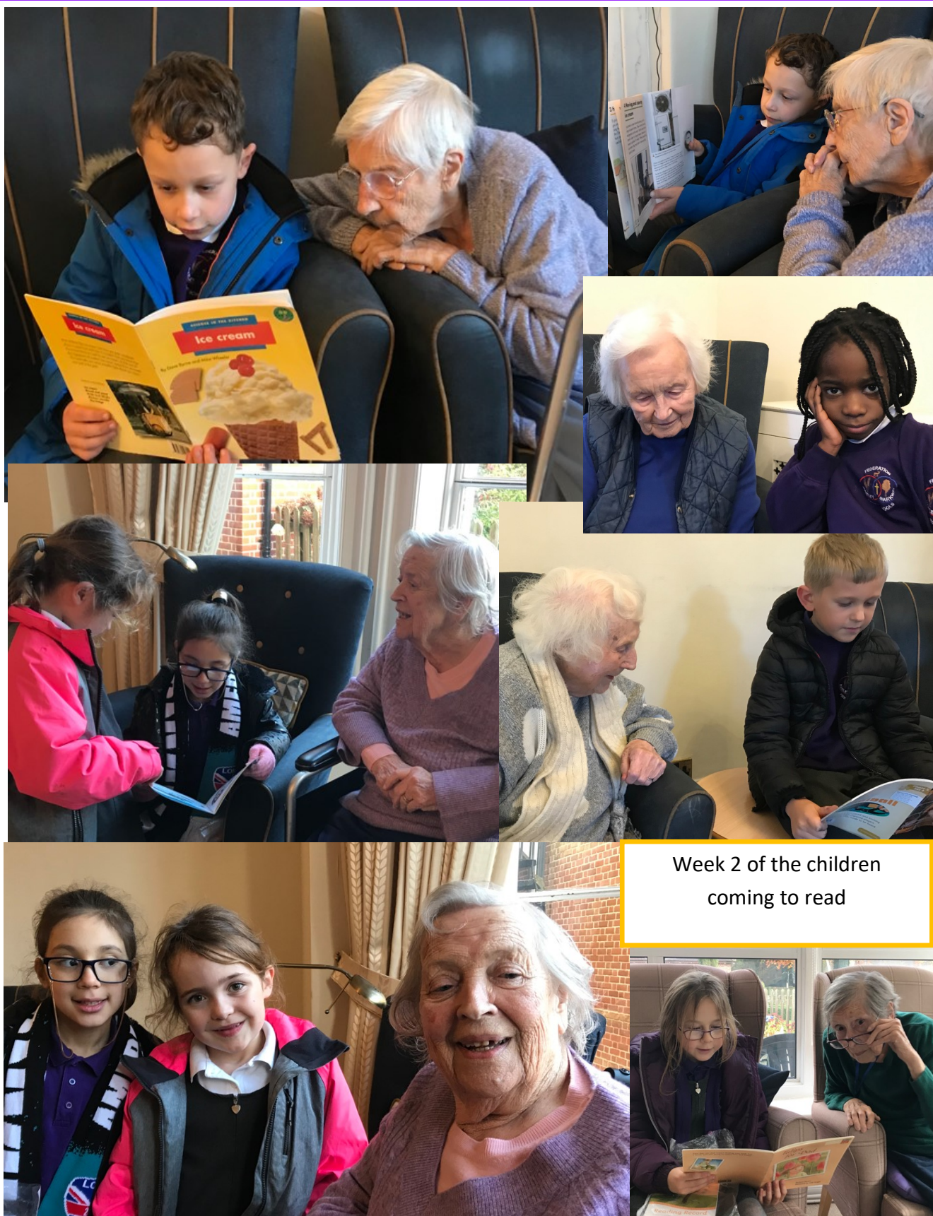
Week 2 of the children coming to read

Please visit our website to see all the activities that we have coming up for the following month : www.margarethouse.co.uk/News & Event's