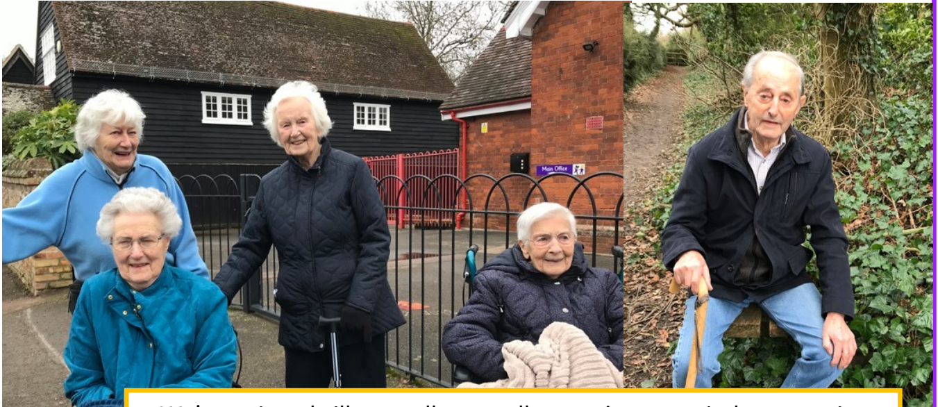
We've enjoyed village walks as well as getting some indoor exercise