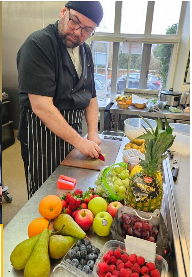
We celebrated a 90th Birthday, then the chefs got prepping for our Spanish themed Supper Club