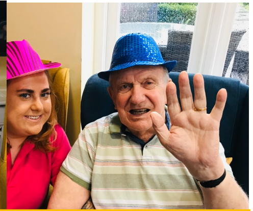
Kiddley Divey made for a colourful morning of movement, music, fun and laughter