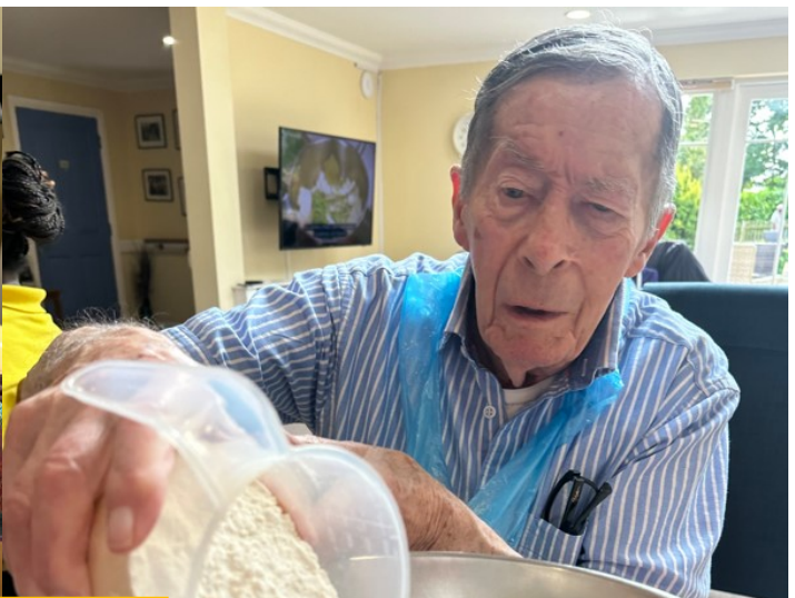
We made our own brownies, which everyone then enjoyed with a cup of tea in the afternoon