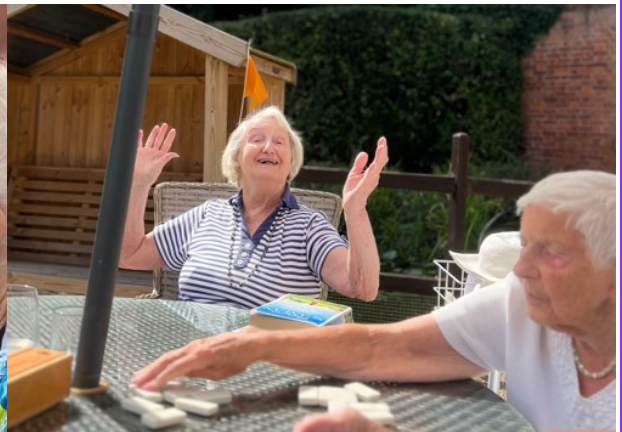
And have kept up with our games indoors and out as well as our word puzzles