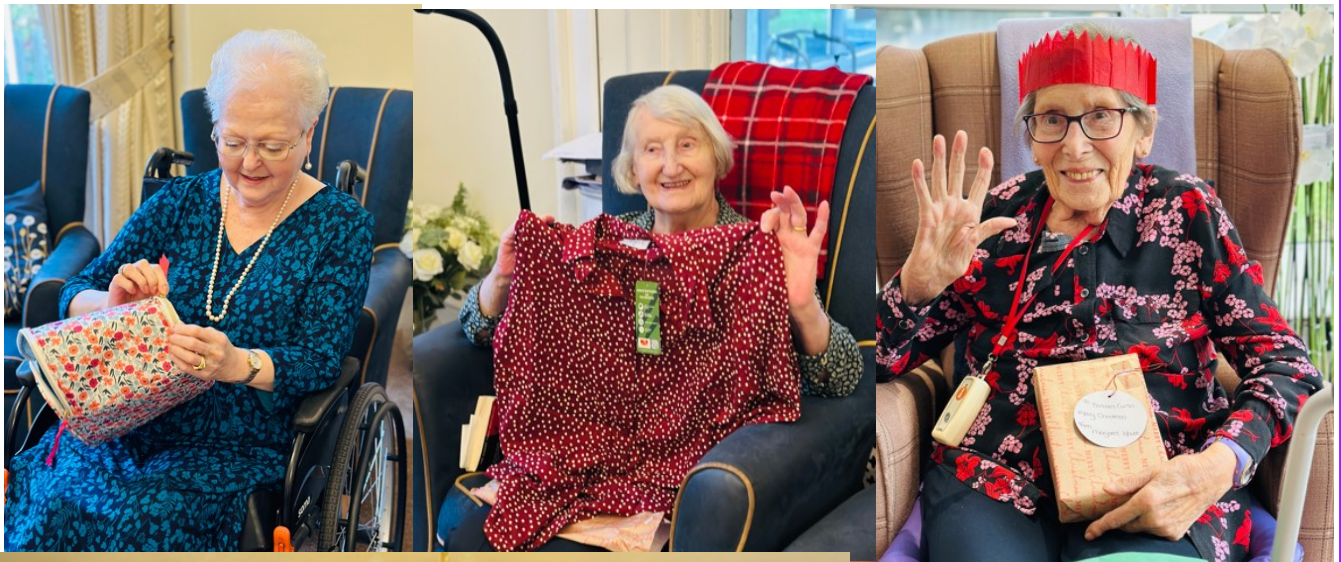
Opening our presents before we sat down for lunch