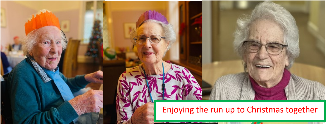
Enjoying the run up to Christmas together