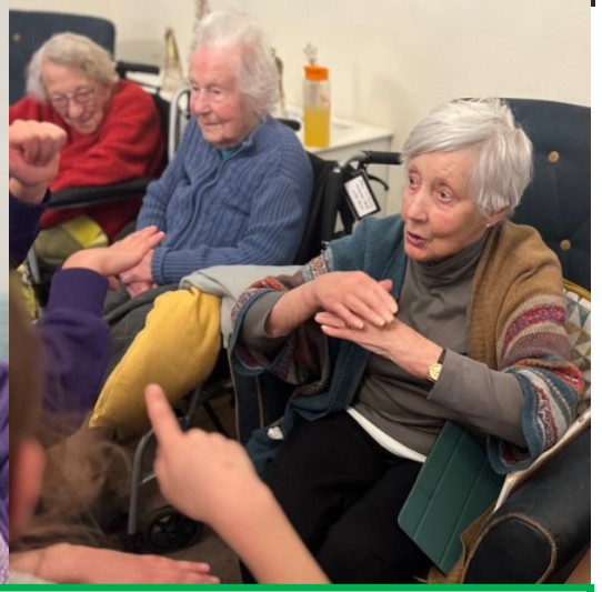
Learning Makaton & singing carols